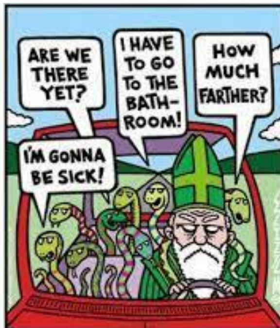
St. Patrick driving the snakes out of Ireland.