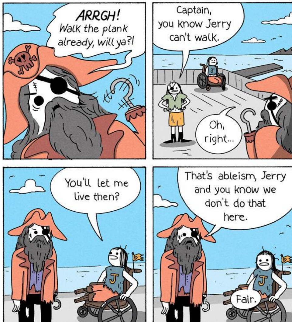
War and Peas

A photographer will be in attendance at next week's game.