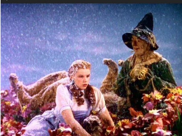
The "snow" in the Wizard of Oz movie was 100% pure asbestos.