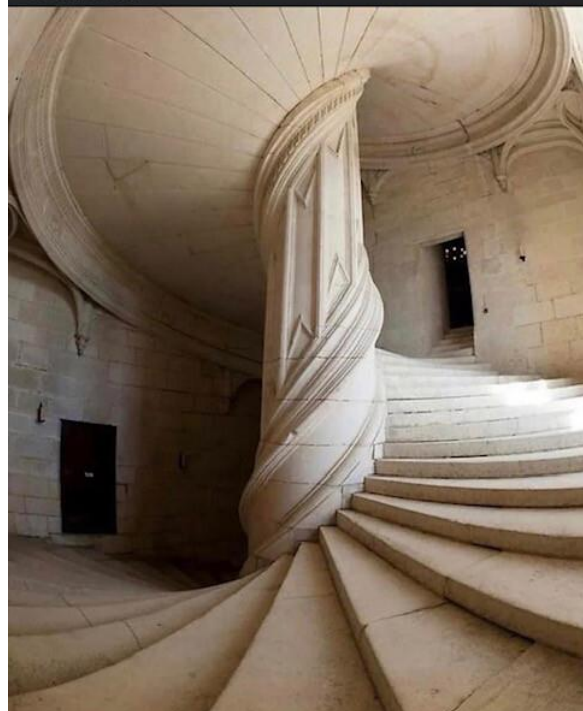
Double helix staircase designed by Leonardo da Vinci, 1516.