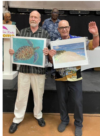
Non-Caribbean Mixed Pairs Winners Pelau Open Pairs Winners Runners-up, Lady Burton Open Pairs

And just to get you in the mood, click here for some old-time Barbados music (and scenery).